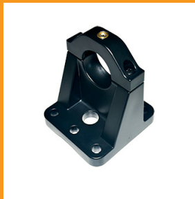
Ball & Socket Mounting Bracket