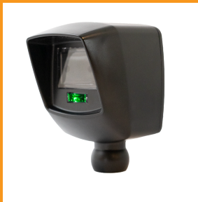
Integrated Sensor Hood