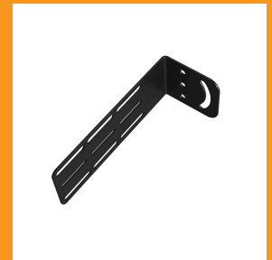
Optional: HRD-288-1 Universal Mounting Bracket